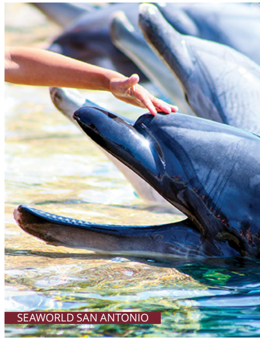
SEAWORLD SAN ANTONIO

combines fun with education and appreciation for some of the ocean's most fascinating creatures through shows, educational exhibits and rides. Explore Aquatica , a water park designed as a South Seas oasis with all the amenities of a beachside resort, including terraced pools, a giant wave pool, meandering crystal-blue rivers, sandy beaches and private cabanas. Aquatica boasts unique attractions