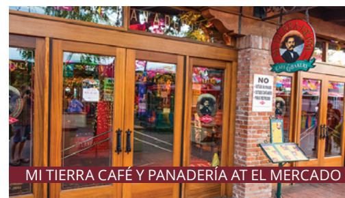
MI TIERRA CAFÉ Y PANADERIA AT EL MERCADO

in 1835 and 1836. Today, La Villita is a haven for artists and craftsmen. Collectibles such as blown glass, jewelry, handcrafts and fashions reflect Mexican and Central American influences. When the city was the capital of the Spanish Province of Texas, the Spanish Governor's Palace was the seat of government. This historic structure is open to the public and resides downtown near City Hall and San Fernando Cathedral . Canary Islanders began construction on San Fernando Cathedral in 1731, making it the nation's oldest cathedral sanctuary.