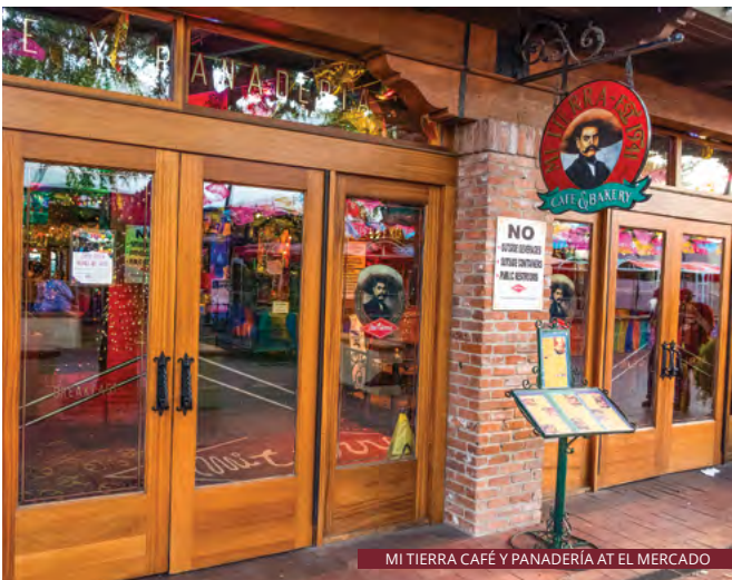
MI TIERRA CAFÉ Y PANADERÍA AT EL MERCADO

San Antonio’s non-profit theme park is Morgan’s Wonderland . Designed specifically for individuals with special needs, Morgan’s Wonderland is the world’s first ultra-accessible family fun park. Morgan’s Wonderland