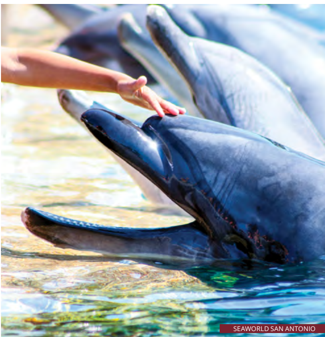
SEAWORLD SAN ANTONIO